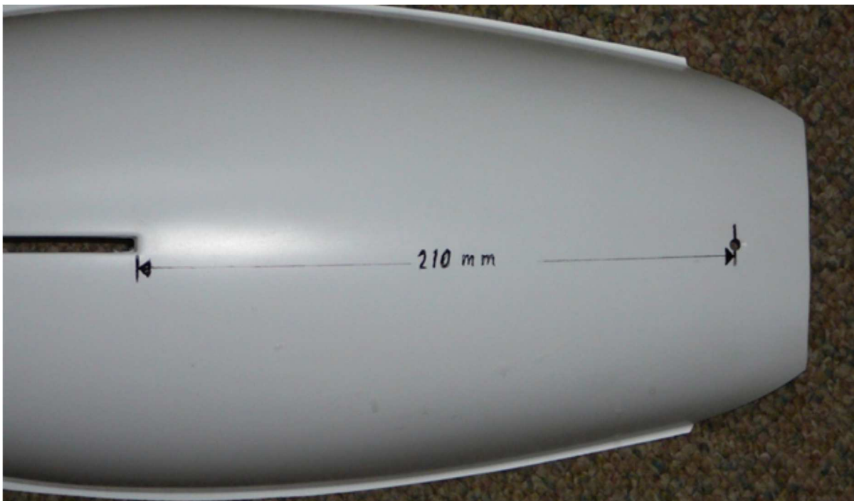
Figure 1: rudder position